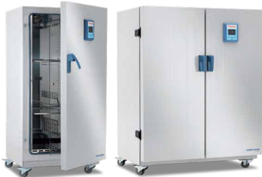
400 L and 750 L unit available

Large capacity models designed for high sample volume