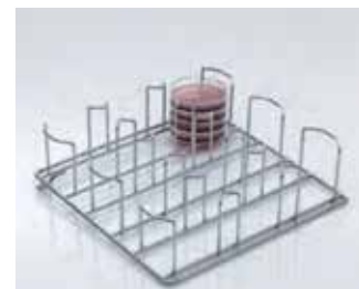
Petri dish holder