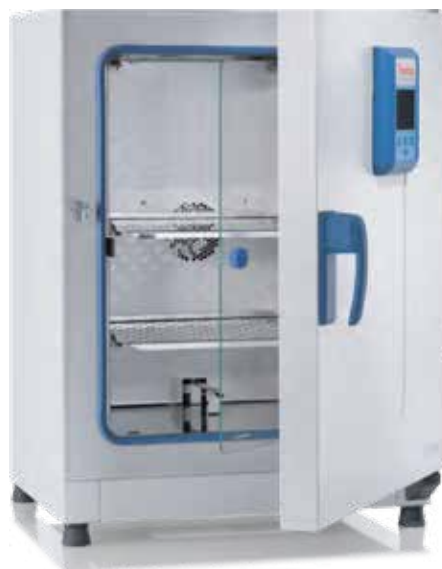
Heratherm Advanced Protocol Microbiological Incubator with unique dual convection, 180 L model pictured