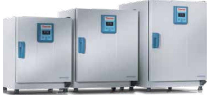
Heratherm General Protocol Microbiological Incubators, 60 L, 100 L, 180 L models