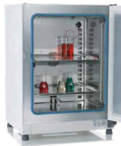
Heratherm Advanced Protocol Security microbiological incubator with unique dual convection and additional alarm systems, 100 L unit pictured

Incorporates additional safety features for ultimate sample protection