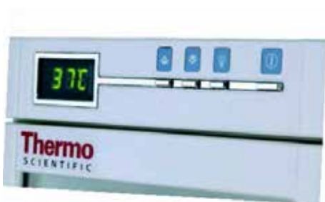
Easy to use interface

Effective testing methods for diagnosis and treatment require culturing the bacteria at 41.5° to 42°C. The use of anaerobe jars or gas packs is recommended, since low oxygen conditions improve the growth.