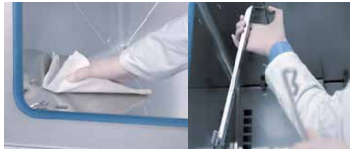
Smooth inner chamber with easy to clean rounded corners