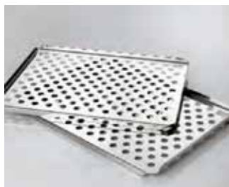
Stainless steel perforated shelves