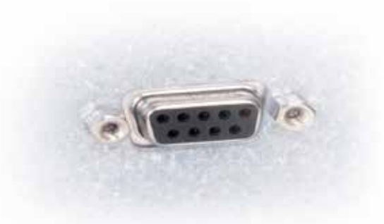
RS232 standard on all General Protocol, Advanced Protocol and Advanced Protocol Security models/sizes