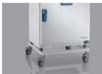
Support stand with casters