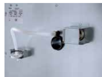
Fresh air particle filter