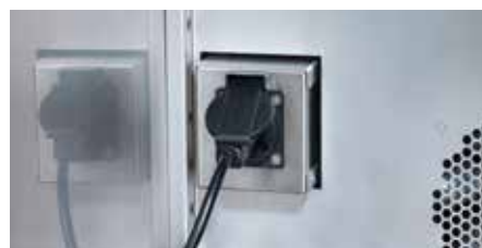
Heratherm Advanced Protocol incubators with internal socket for connection of electrical device (e.g. stirrer / shaker)