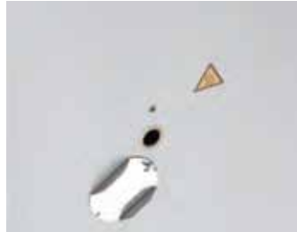
Additional access port right