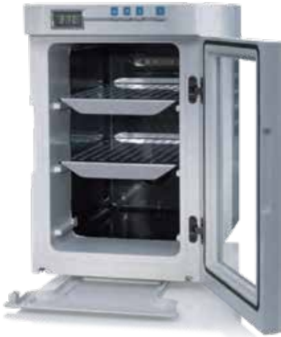
Heratherm Compact Microbiological Incubator, 18 L

The most compact unit of the Heratherm Microbiological Incubator family has an 18 L capacity, ideal for a personalized workspace