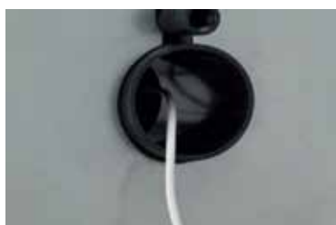
Rear view of the 100 L Advanced Protocol Smart-Vue Wireless Monitoring Solution

Find out more at thermofisher.com/incubators